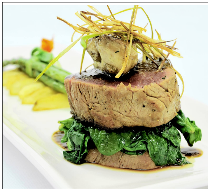
Whether its fillet or cheese cake, the Mount Grace food team like keeping it fresh and simple on the palate and the plate.

Both management and staff are young and enthusiastic to make this a special stay. I loved the staff who were around to help whether you were trying to find your way to the spa or couldn't decide on a drink. They're never intrusive and there's a confidence that's fun to embrace.